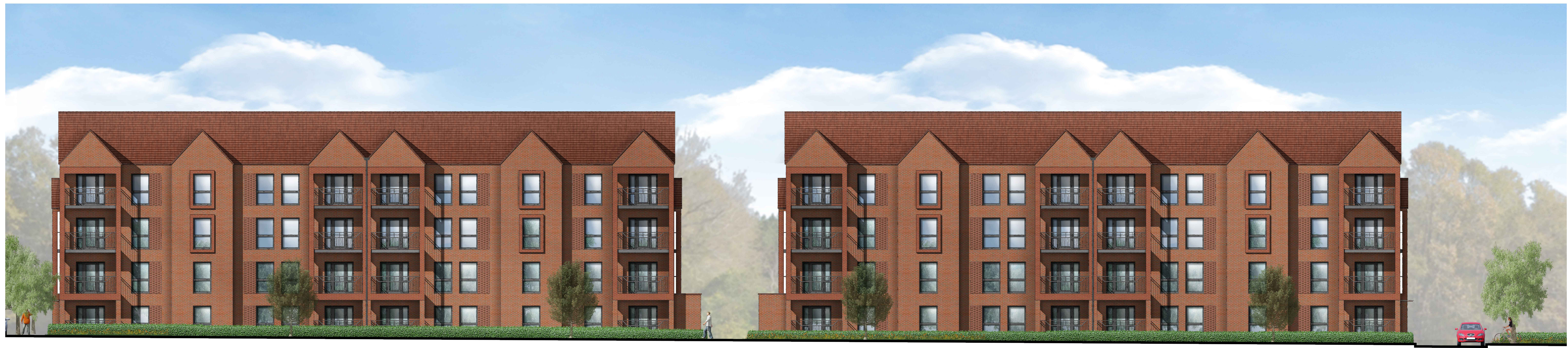
Bradshaw Court - Block 2 Plots 21-40