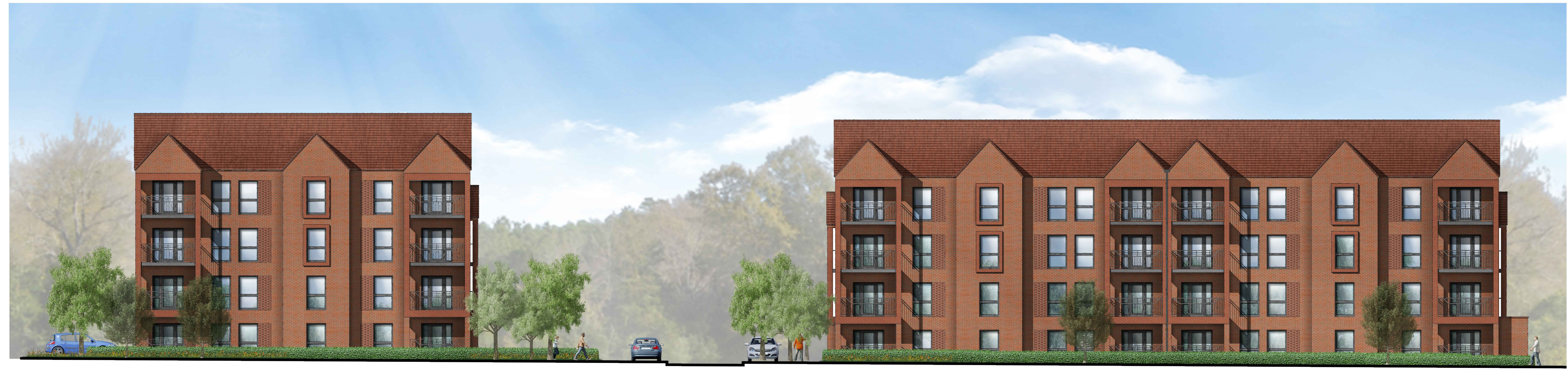
Tampion Court - Block 3 Plots 41-50